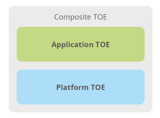
Figure 3: Composite Product

The Composite TOE is a TOE that is composed of a superposition of 2 layers as depicted in Figure 3, the initial layer (identified as the 'Platform') and the supplementary layer (the 'Application'):