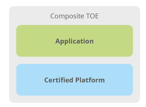
Figure 2: Composite product evaluation (current approach)

The hardware platform properties related to security and security functionality are provided in the security target. The platform provides mechanisms to protect the composite product assets, but the composite product behaviour depends widely on the software application having to use, to configure and activate these security mechanisms.